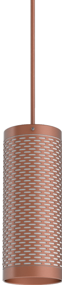
PAC0820GV CO - Copper Metallic