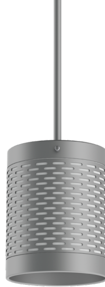
PAC0810GV PT - Platinum Silver