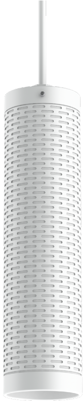
PAC0624GV MW - Matte White