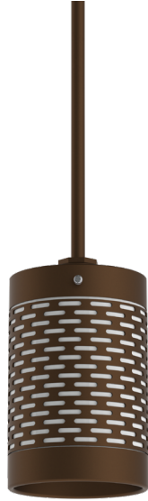
PAC0609GV BZ - Bronze