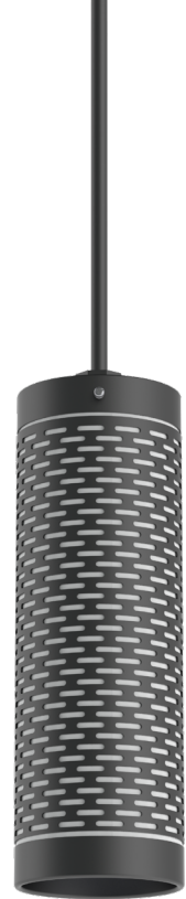
PAC0618GV MB - Matte Black