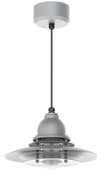
CN1308GV SHOWN WITH RDC5CM