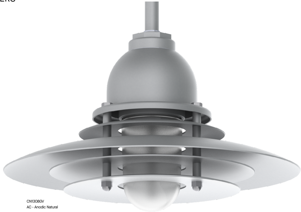
CN1308GV AC - Anodic Natural