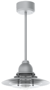
CN1308GV SHOWN WITH RDC5PM