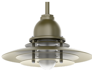
CN1308GV AC - Anodic Champagne