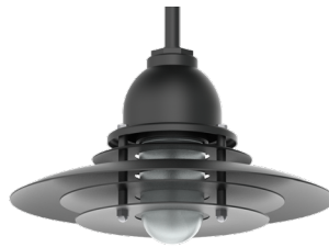
CN1308GV MB - Matte Black