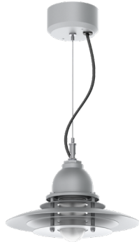
CN1308GV SHOWN WITH RDC5CD