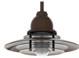
CN1308GV BR - Breccia