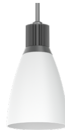
DP8XT PT - Platinum Silver