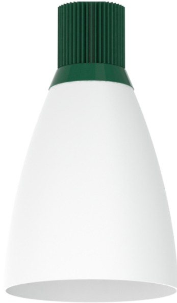
DP8XT EG - Evergreen