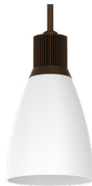
DP8XT BZ - Bronze