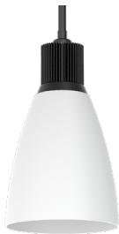
DP8XT MB - Matte Black