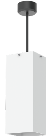
CY0820SQFAGV MB - Matte Black