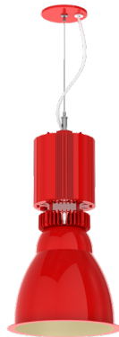
RPEXT1014XT SHOWN WITH CD