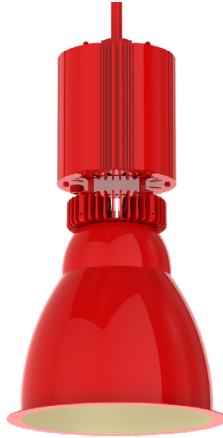
RPEXT1014XT RD - Red Baron ALI - Almond Interior