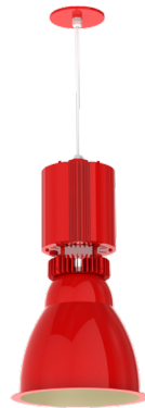
RPEXT1014XT SHOWN WITH CM