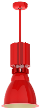
RPEXT1014XT SHOWN WITH PM