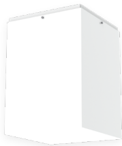
CY1520SQFAGV MW - Matte White