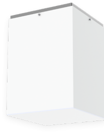
CY1520SQFAGV SHOWN WITH SM