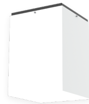
CY1520SQFAGV MB - Matte Black