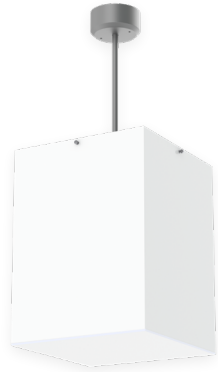
CY1520SQFAGV SHOWN WITH RDC5PM