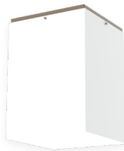
CY1520SQFAGV AZ - Anodic Bronze