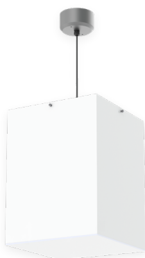
CY1520SQFAGV SHOWN WITH RDC5CM