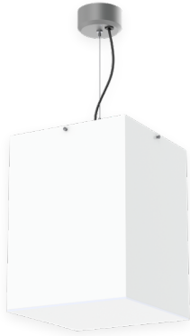
CY1520SQFAGV SHOWN WITH RDC5CD