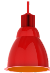
RP1014XT RD - Red Baron ORI - Orange Interior