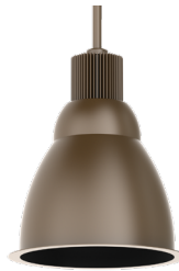
RP1014XT AZ - Anodic Bronze AKI - Anodic Black Interior