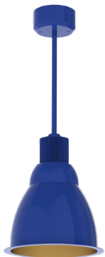
RP1014XT SHOWN WITH RDC5PM