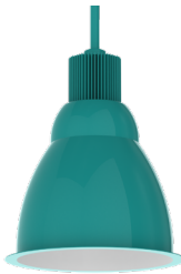
RP1014XT TQ - Turquoise GWI - Gloss White Interior