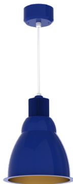
RP1014XT SHOWN WITH RDC5CM