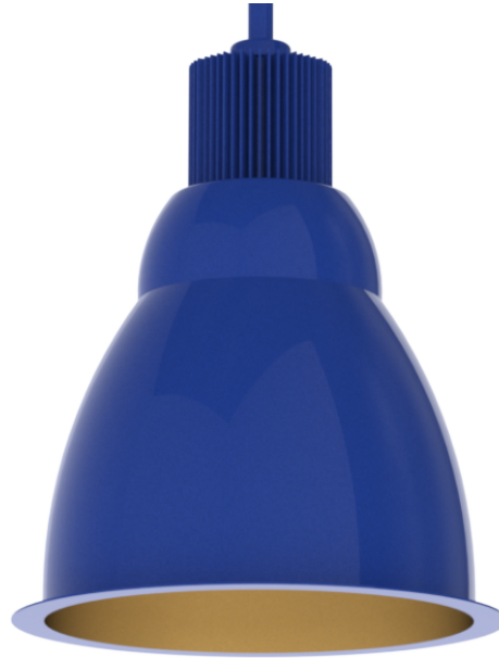
RP1014XT BL - Blue Streak SNI - Sun Gold Interior

PROJECT: _____ QUANTITY: _____ TYPE: _____