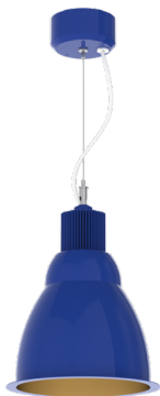
RP1014XT SHOWN WITH RDC5CD