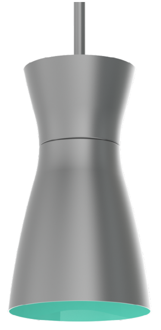
MF0713DGV PT - Platinum Silver SFI - Sea Foam Interior