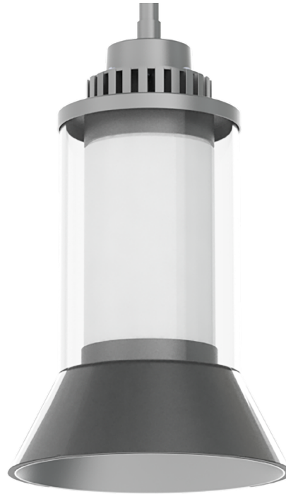
AF0812COAFIAGV PT - Platinum Silver