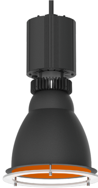
RPEXT1014XT MT - Textured Silver ORI - Orange Interior FGR - Frosted Glass Ring