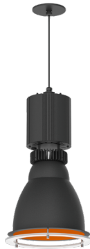
RPEXT1014XT SHOWN WITH CM