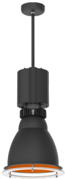
RPEXT1014XT SHOWN WITH PM