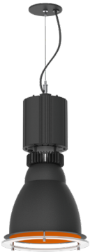
RPEXT1014XT SHOWN WITH CD