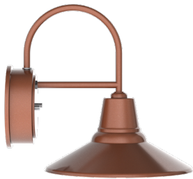
ZV1206GV SHOWN WITH WM