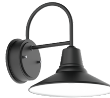
ZV1206GV MB - Matte Black