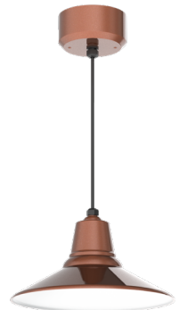
ZV1206GV SHOWN WITH RDC5CM