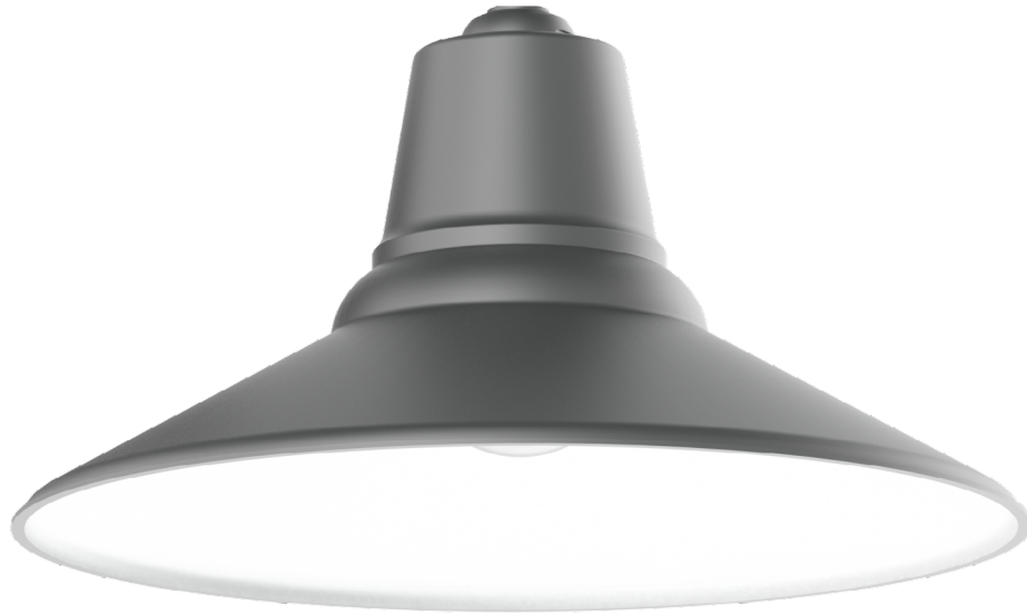
ZV1206GV PT - Platinum Silver