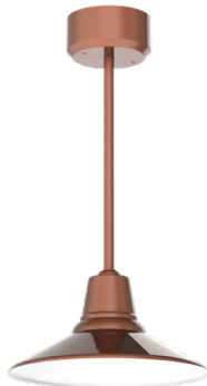
ZV1206GV SHOWN WITH RDC5PM

HM / AT / PM HANG STRAIGHT / ALL THREAD / PENDANT