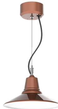
ZV1206GV SHOWN WITH RDC5CD