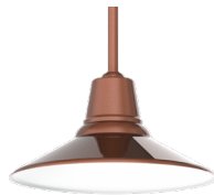
ZV1206GV CO - Copper