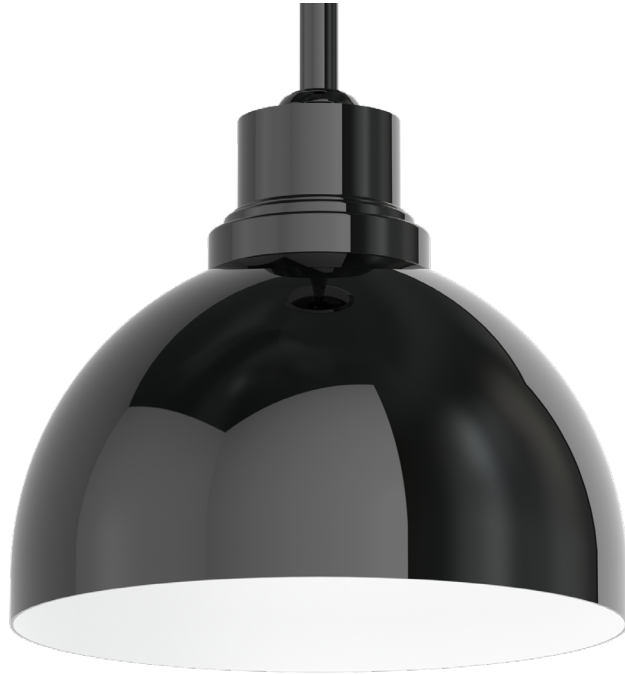
SD1208GV GB - Gloss Black MWI - Matte White Interior

PROJECT: _____ QUANTITY: _____ TYPE: _____