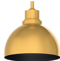
SD1208GV SN - Sun Gold MBI - Matte Black Interior