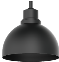
SD1208GV MB - Matte Black GBI - Gloss Black Interior