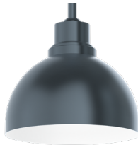
SD1208GV AS - Anodic Sapphire MWI - Matte White Interior