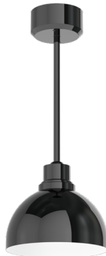
SD1208GV SHOWN WITH RDC5PM

HM / AT / PM HANG STRAIGHT / ALL THREAD / PENDANT