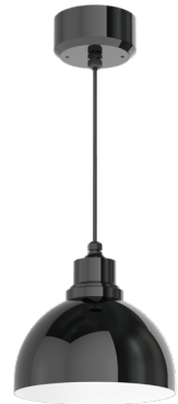
SD1208GV SHOWN WITH RDC5CM