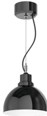
SD1208GV SHOWN WITH RDC5CD