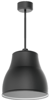
SP1414GV SHOWN WITH RDC5PM