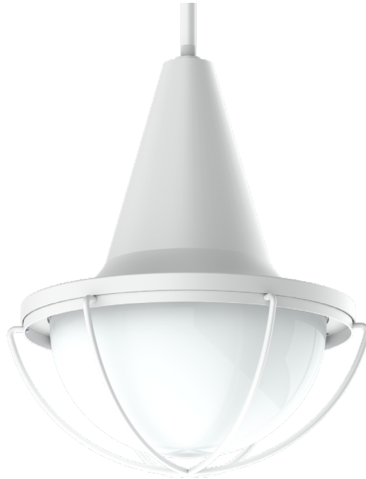
BL1317GV MW - Matte White