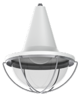
BL1317GV SHOWN WITH CGG