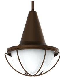
BL1317GV BZ - Bronze