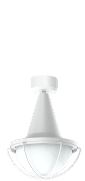
BL1317GV SHOWN WITH SM