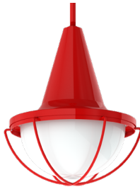
BL1317GV RD - Red Baron