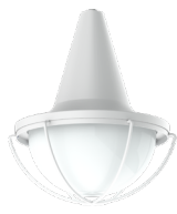
BL1317GV SHOWN WITH FGG