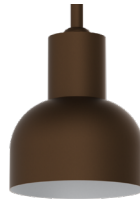
ET60GV BZ - Bronze ANI - Anodic Natural Interior