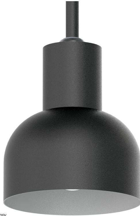
ET60GV MB - Matte Black MWI - Matte White Interior

PROJECT: _____ QUANTITY: _____ TYPE: _____