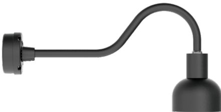
ET60GV SHOWN WITH CP104PA23