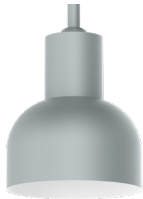
ET60GV AM - Anodic Malachite MWI - Matte White Interior