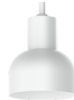
ET60GV MW - Matte White FCI - Fixture Color Interior