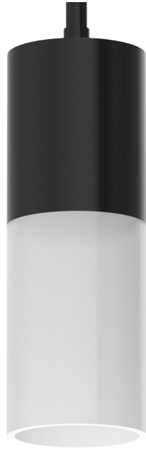
CYO405DXT FACY6 - 6" Frosted Clear Acrylic AB - Anodic Black