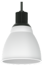
GP1014XT CH - Charcoal