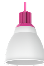
GP1014XT PK - Pink