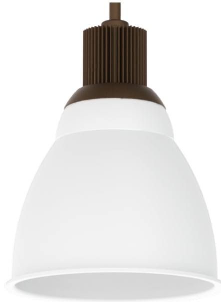
GP1014XT BZ - Bronze