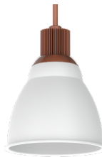
GP1014XT CO - Copper Metallic