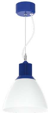
DP12XT SHOWN WITH RDC5CD