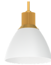
DP12XT SN - Sun Gold