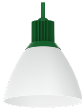
DP12XT PG - Pub Green