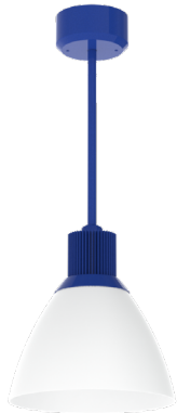
DP12XT SHOWN WITH RDC5PM