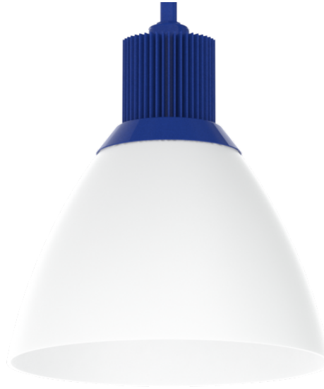
DP12XT BL - Blue Streak

PROJECT: _____ QUANTITY: _____ TYPE: _____