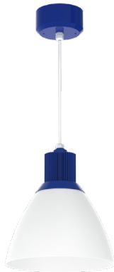
DP12XT SHOWN WITH RDC5CM