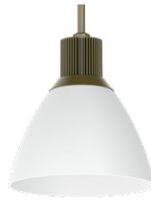
DP12XT AC - Anodic Champagne