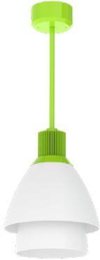
LG1212XT SHOWN WITH PM