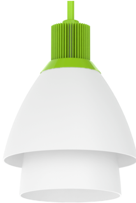
LG1212XT LG - Lime Green

PROJECT: _____ QUANTITY: _____ TYPE: _____