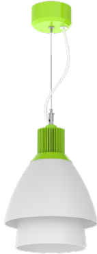
LG1212XT SHOWN WITH CD