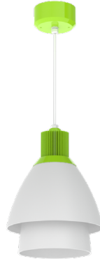
LG1212XT SHOWN WITH CM