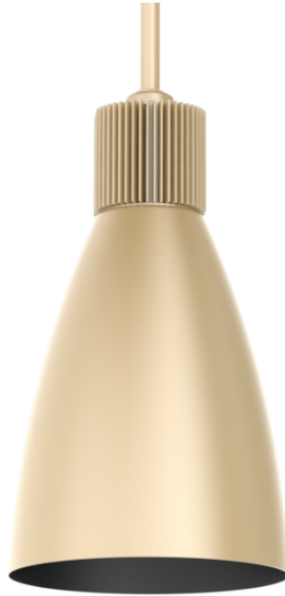
AP8XT SN - Sun Gold MBI - Matte Black Interior