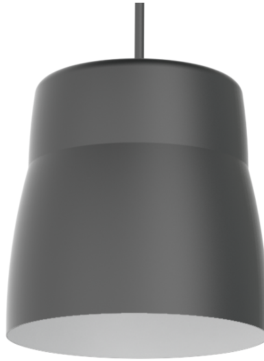
BP1616GV MB - Matte Black MWI - Matte White Interior