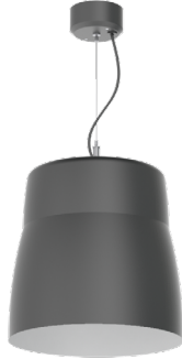
BP1616GV SHOWN WITH RDC5CD