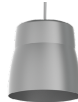
BP1616GV PT - Platinum Silver FCI - Fixture Color Interior