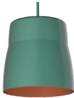
BP1616GV VG - Verde Green CMI - Copper Metallic Interior