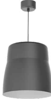
BP1616GV SHOWN WITH RDC5CM