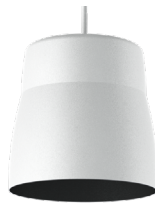
BP1616GV MW - Matte White TBI - Textured Black Interior