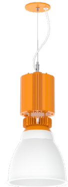
GPEXT1014XT SHOWN WITH CD