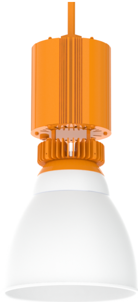
GPEXT1014XT OR - Orange