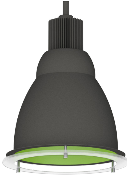
RP1014XT GH - Graphite LGI - Lime Green Interior FGR - Frosted Glass Ring