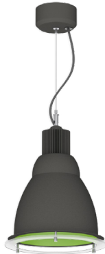
RP1014XT SHOWN WITH RDC5CD