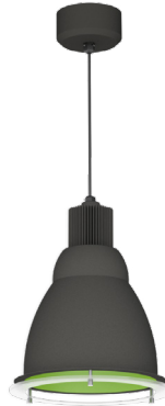
RP1014XT SHOWN WITH RDC5CM