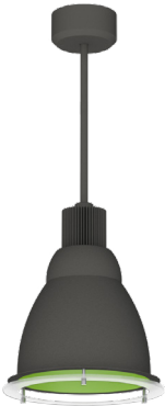
RP1014XT SHOWN WITH RDC5PM