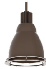
RP1014XT BR - Brecchia BZI - Bronze Interior 1MR - Single Metal Ring