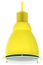
RP1014XT AY - Aero Yellow EGI - Evergreen Interior CFG - Center Frosted Glass Tier