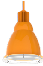
RP1014XT OR - Orange MWI - Matte White Interior FGR - Frosted Glass Tier