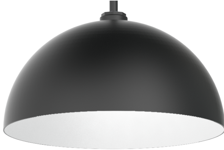
HD1606GV MB - Matte Black MWI - Matte White Interior

PROJECT: _____ QUANTITY: _____ TYPE: _____