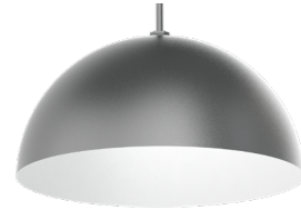
HD2412GV PT - Platinum Silver MWI - Matte White Interior