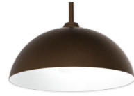
HD1606GV BZ - Bronze MWI - Matte White Interior