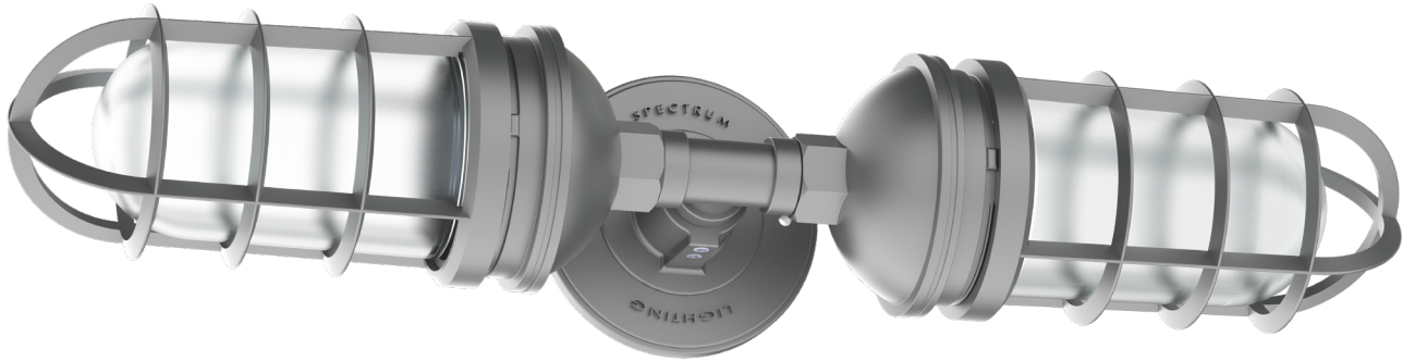
WJ1X2INC PT - Platinum Silver