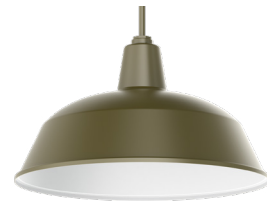
WS2414GV AC - Anodic Champagne