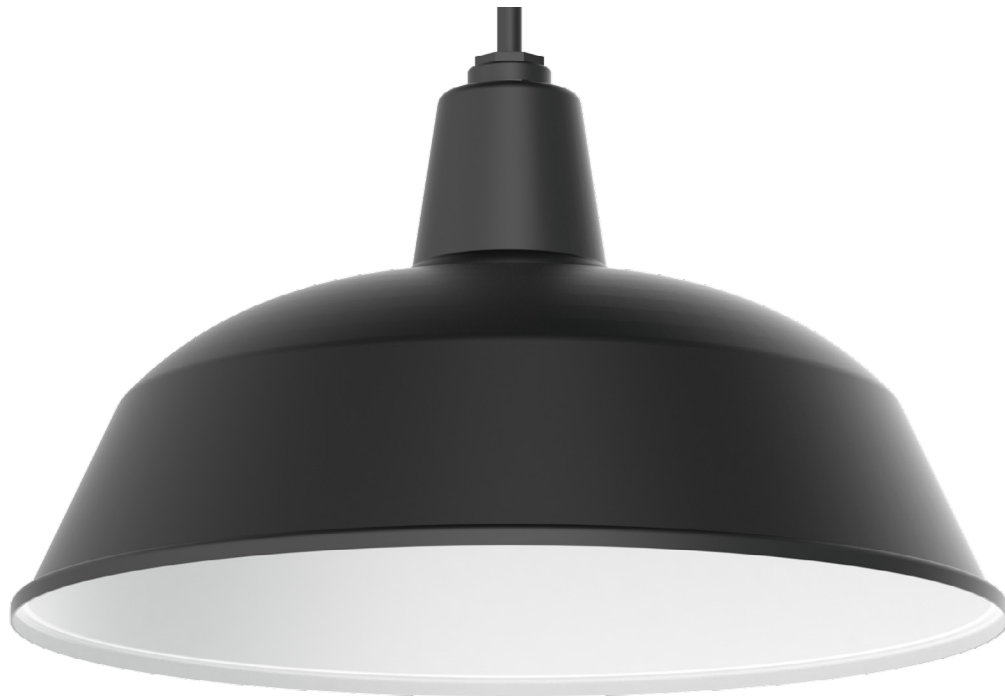
WS2414GV MB - Matte Black

PROJECT: _____ QUANTITY: _____ TYPE: _____