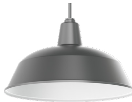
WS2414GV PT - Platinum Silver