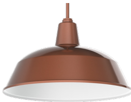
WS2414GV CO - Copper Metallic