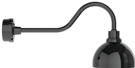
SD1208GV SHOWN WITH CP104PA23