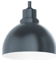
SD1208GV AS - Anodic Sapphire MWI - Matte White Interior