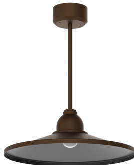
FP1906GV SHOWN WITH RDC5PM

HM / AT / PM HANG STRAIGHT / ALL THREAD / PENDANT