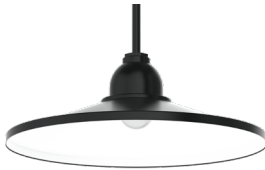
FP1906GV AK - Anodic Black MWI - Matte White Interior