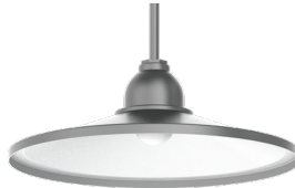
FP1906GV PT - Platinum Silver MWI - Matte White Interior