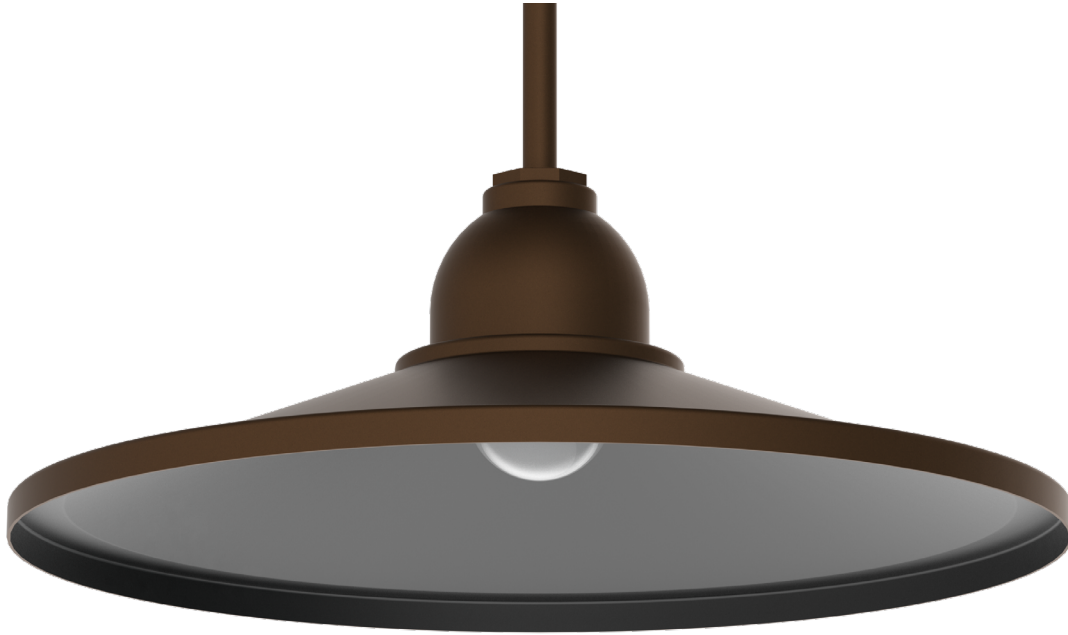
FP1906GV BZ - Bronze MBI - Matte Black Interior