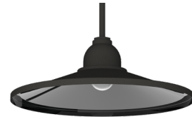
FP1906GV GH - Graphite GBI - Gloss Black Interior