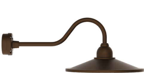
FP1906GV SHOWN WITH CP104PA23