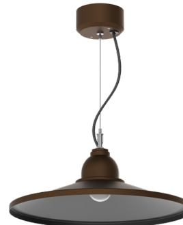
FP1906GV SHOWN WITH RDC5CD