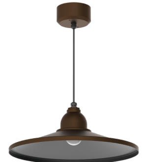
FP1906GV SHOWN WITH RDC5CM