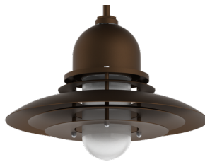
CN1812GV BZ - Bronze