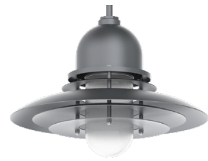
CN1812GV PT - Platinum Silver