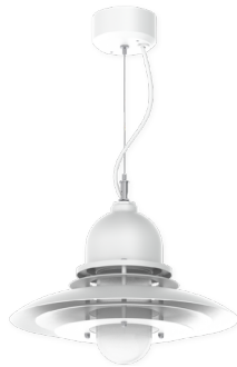
CN1812GV SHOWN WITH RDC5CD