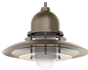
CN1812GV AZ - Anodic Bronze