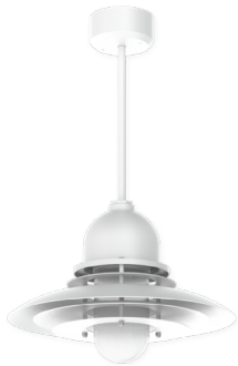
CN1812GV SHOWN WITH RDC5PM