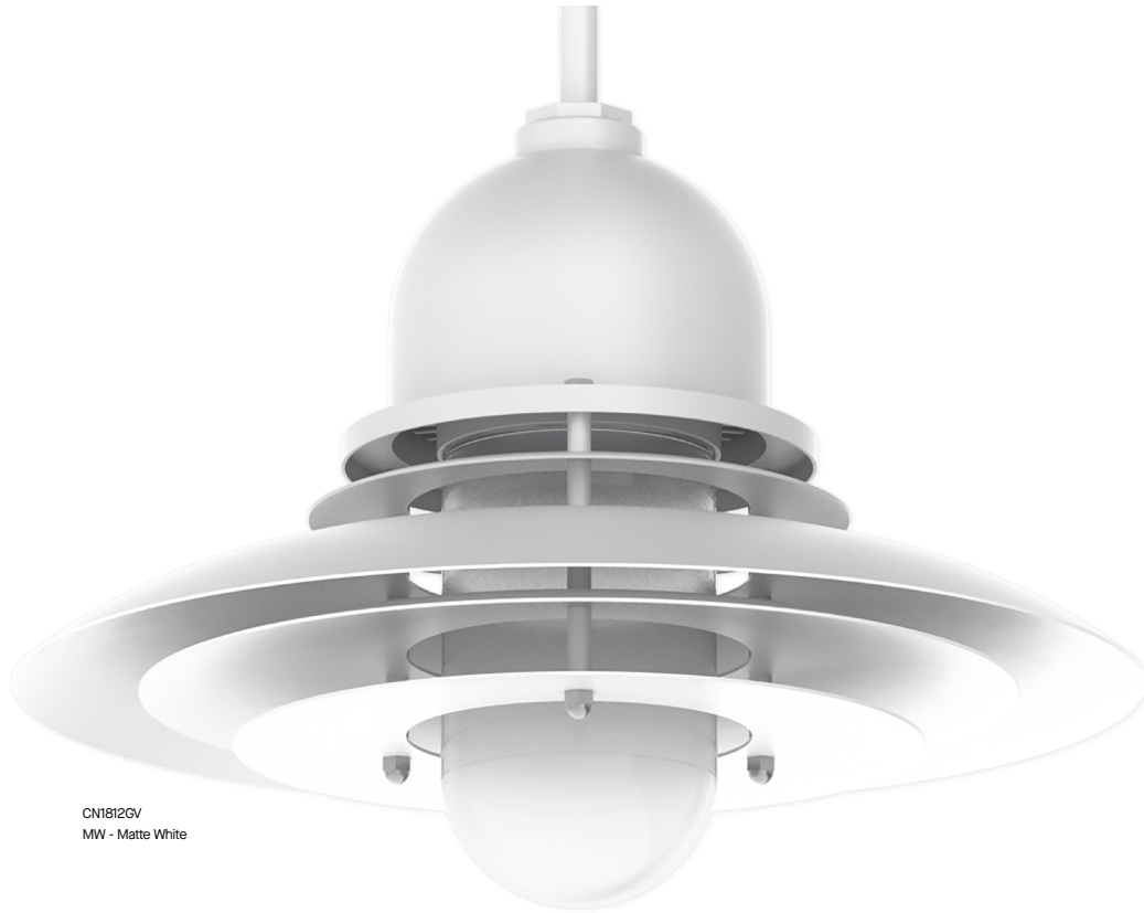
CN1812GV MW - Matte White