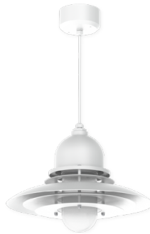
CN1812GV SHOWN WITH RDC5CM