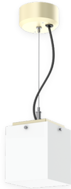
CY0608SQCBFAGV SHOWN WITH RDC5CD