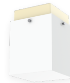
CY0608SQCBFAGV SHOWN WITH SM