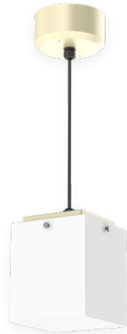
CY0608SQCBFAGV SHOWN WITH RDC5CM