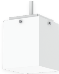
CY0608SQCBFAGV GW - Gloss White