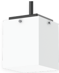
CY0608SQCBFAGV GB - Gloss Black