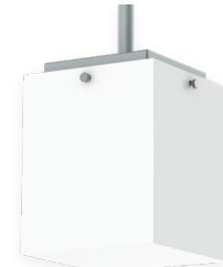
CY0608SQCBFAGV AM - Anodic Malacite