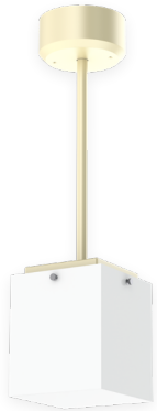
CY0608SQCBFAGV SHOWN WITH RDC5PM