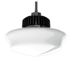
SS16LX GB - Gloss Black