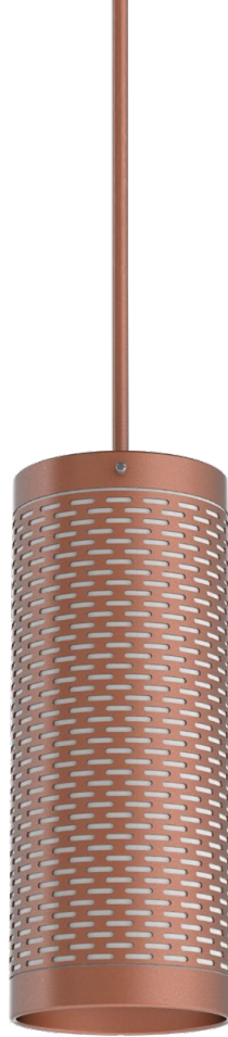
PAC0820GV CO - Copper Metallic