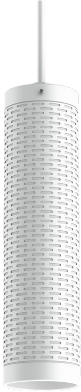
PAC0624GV MW - Matte White